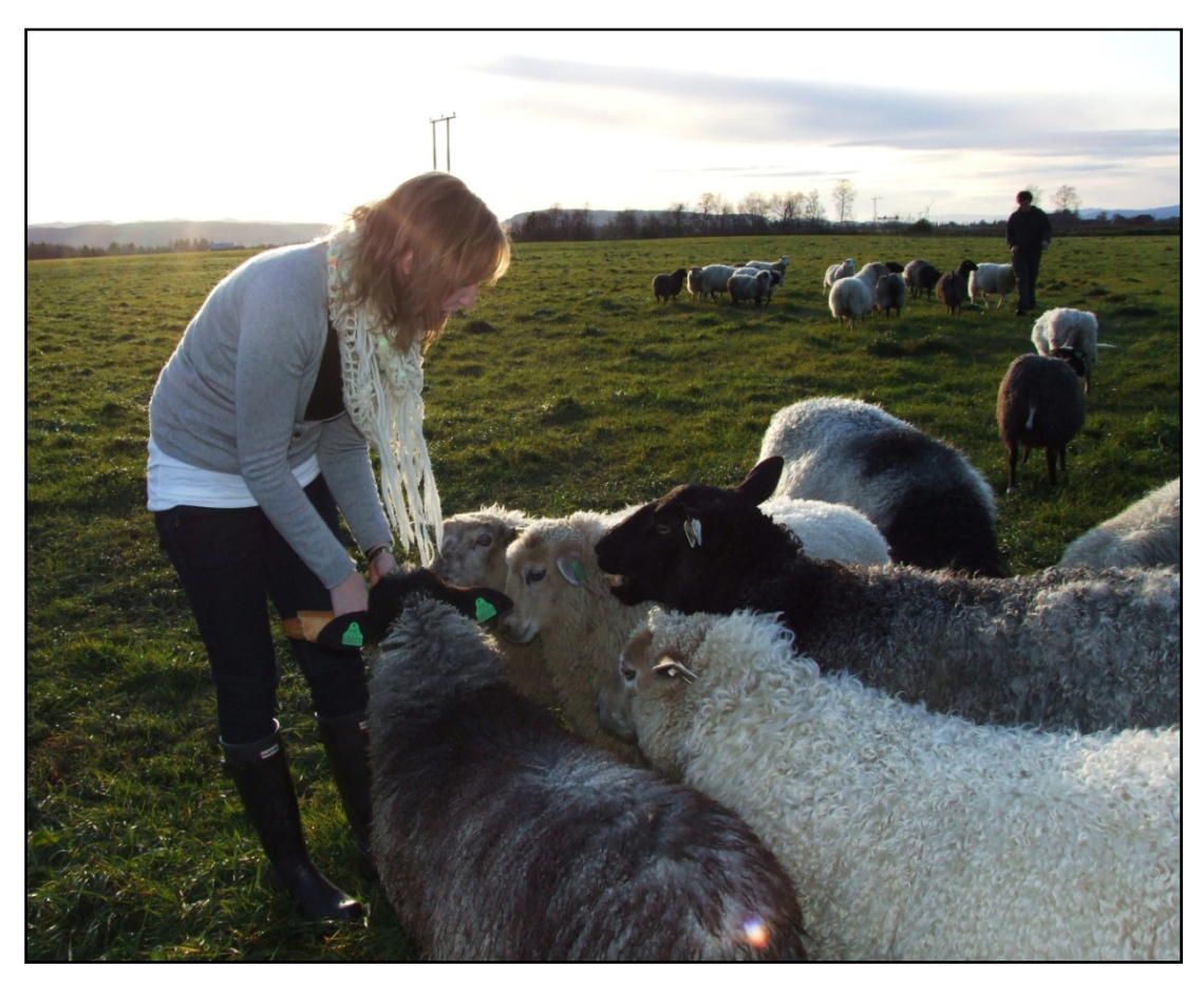
Illustration: The Royal Norwegian Society for Development