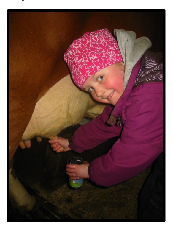
A proud milkmaid, Photo: Kari Myklebust

Green care is also a prioritised focus area in the regional business strategies . These strategies guide county priorities regarding economic tools that aim to facilitate initiatives on agricultural properties. In collaboration with the regional partnerships, the County governors play active roles in the facilitation and development of Green care. Green care is also a topic in county plans and other regional plans. Several counties (e.g. Hordaland, Finnmark, and North Trøndelag) have made their own action plans for Green care. In the County governors' survey of January 2011, we see that at the regional and local levels, the Green care plans are largely based on plans and strategies in the agricultural sector. Green care is mentioned in the agricultural, business and care plans of several community councils