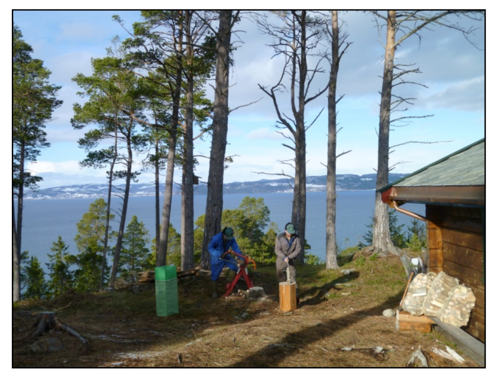
The forest and uncultivated land enable varied work tasks.

Green care shall develop socially beneficial welfare services using farms as service arenas. The basis for developing farms as arenas for welfare services is that farm resources can strengthen the handling of society's welfare tasks. These can be met either by having the services satisfy current quality standards with an increased opportunity for bespoke services for each individual or user, or by providing the stipulated quality in a more efficient manner.