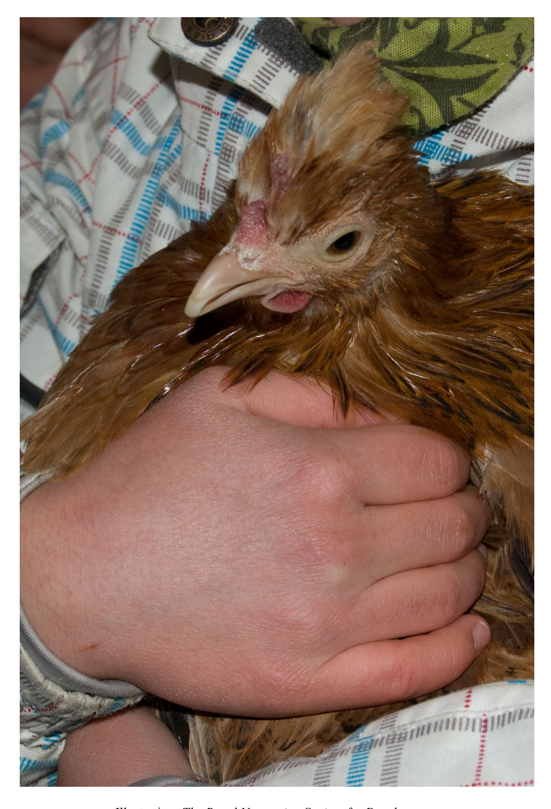
Illustration: The Royal Norwegian Society for Development