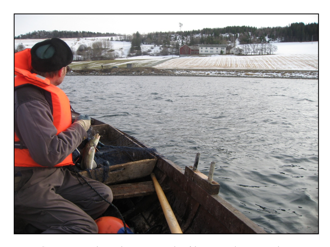
Green care provides good experiences and useful activities.

The figure provides a preliminary summary of already implemented focus areas, areas in need of strengthening, and new focus areas, and will form the basis for further developing the action plan.