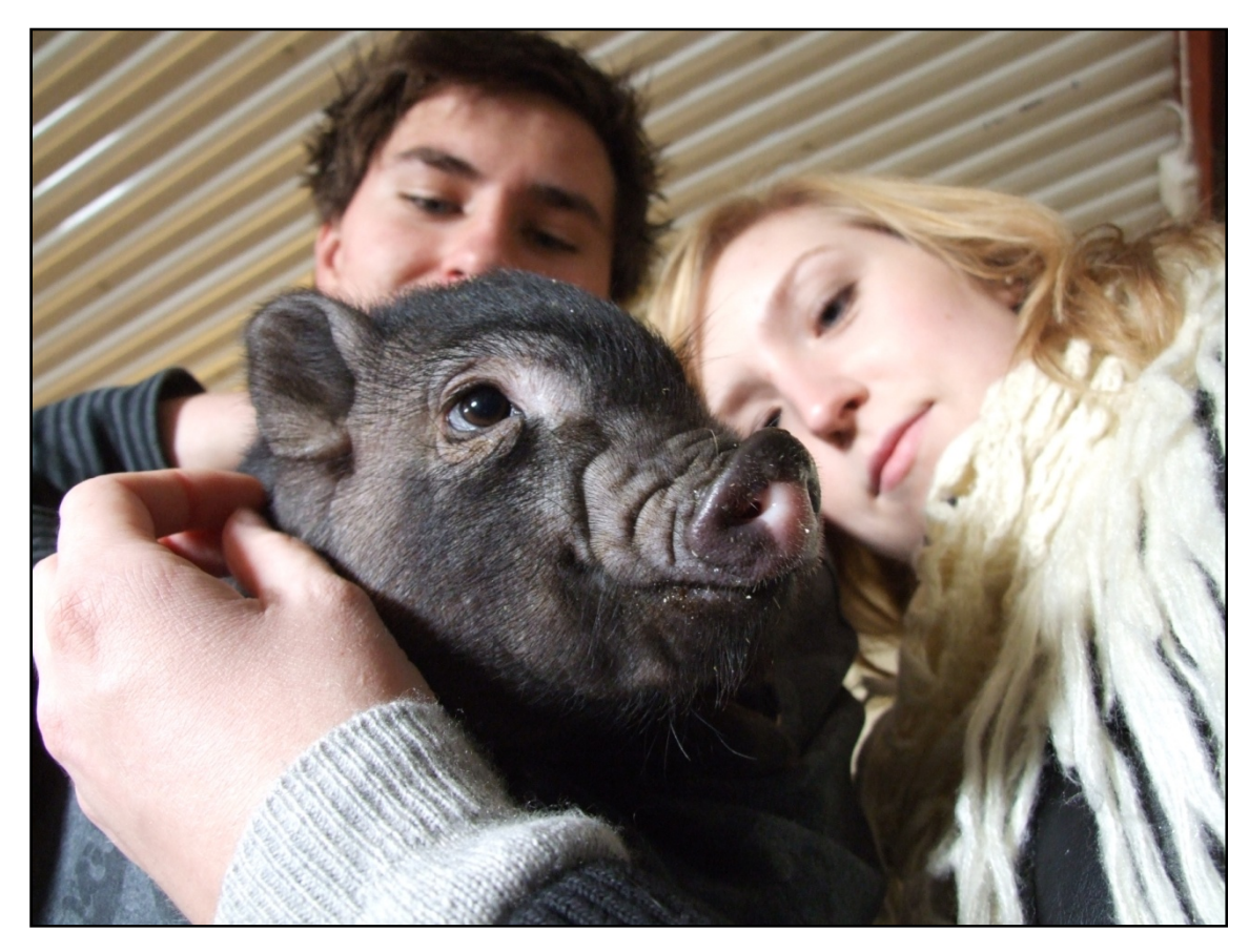
Illustration: The Royal Norwegian Society for Development