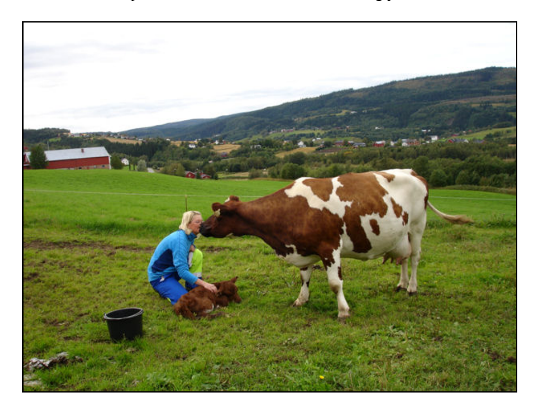
Interaction between people and animals is an important part of Green care

Provider networks have been established in many counties. In Nordland county, an organisation that promotes farm tourism for children and youth, Gårdsferie Nord BA, has been in existence for many years. Such organisations also exist in Trøndelag, Oslo and Akershus. In Hedmark, Rogaland and Hordaland, interest organisations have been created to attend to the professional and social networks among providers.