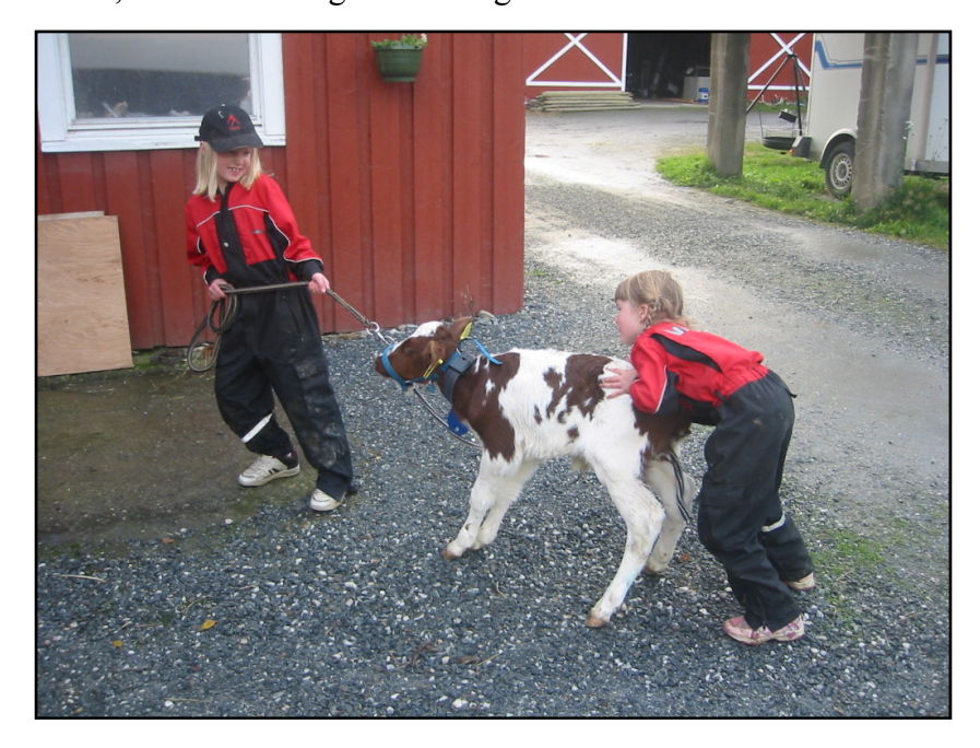
Children and a calf.

Originally, different terms were used for the farm's welfare services, such as Green care, The farm as a pedagogical resource, and Living school. "Into the courtyard" (Inn på tunet) is now becoming the term of choice in Norway, while it still will be termed "Green care" in English. Other countries use terms such as Green Care, Care Farming, Farms for schools, Social Farming or Farming for health.