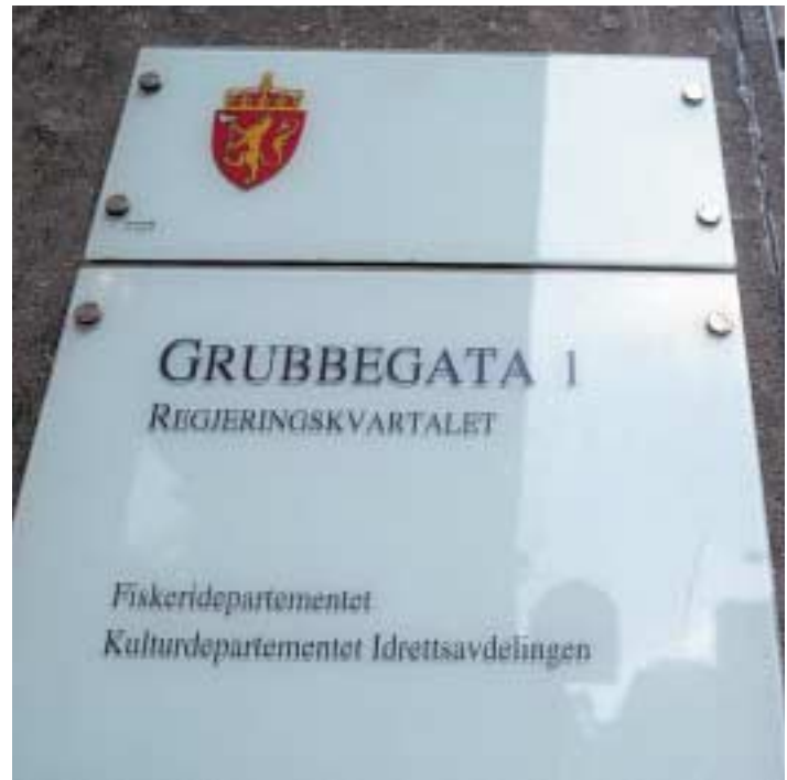
The Department of Sport Policy, Grubbegata 1