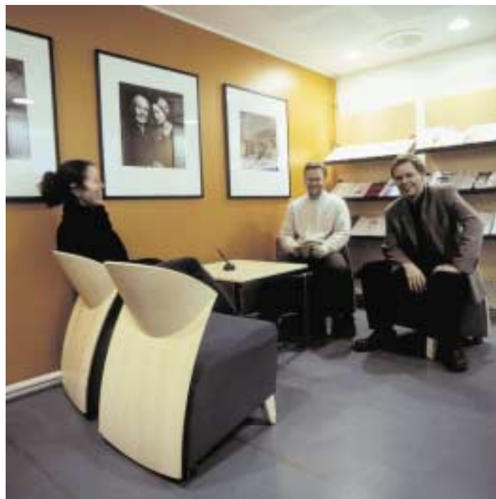
From the Department of Media Policy and Copyright