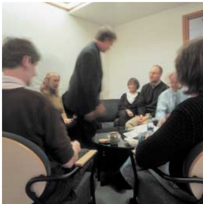
From the Department of Church Affairs