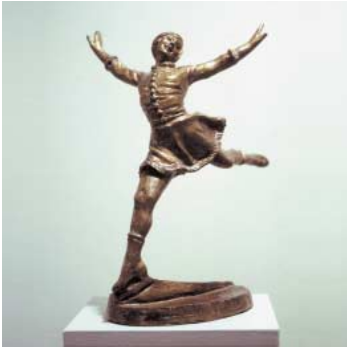
From the Department of Sport Policy