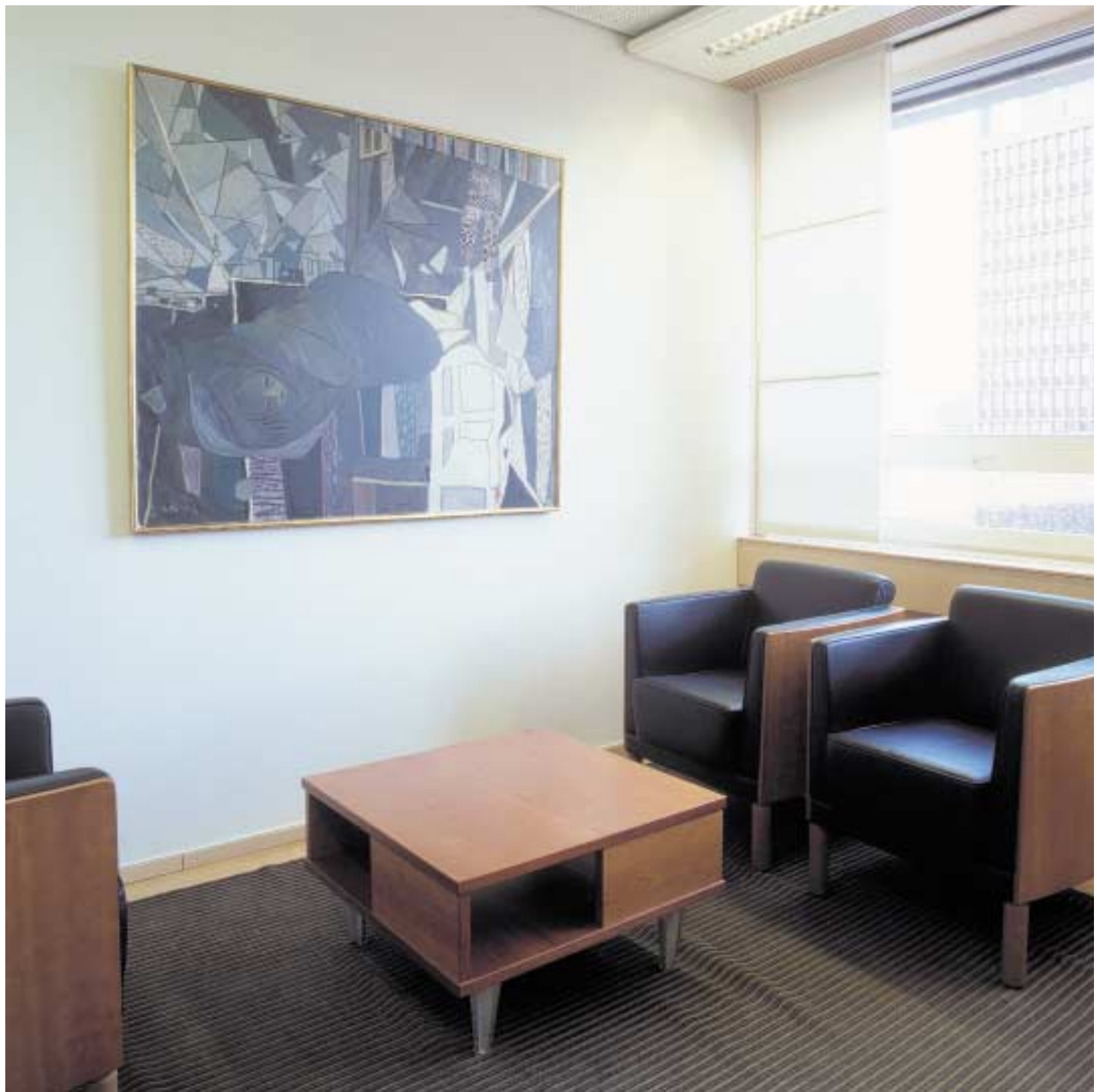
The State Secretary's office