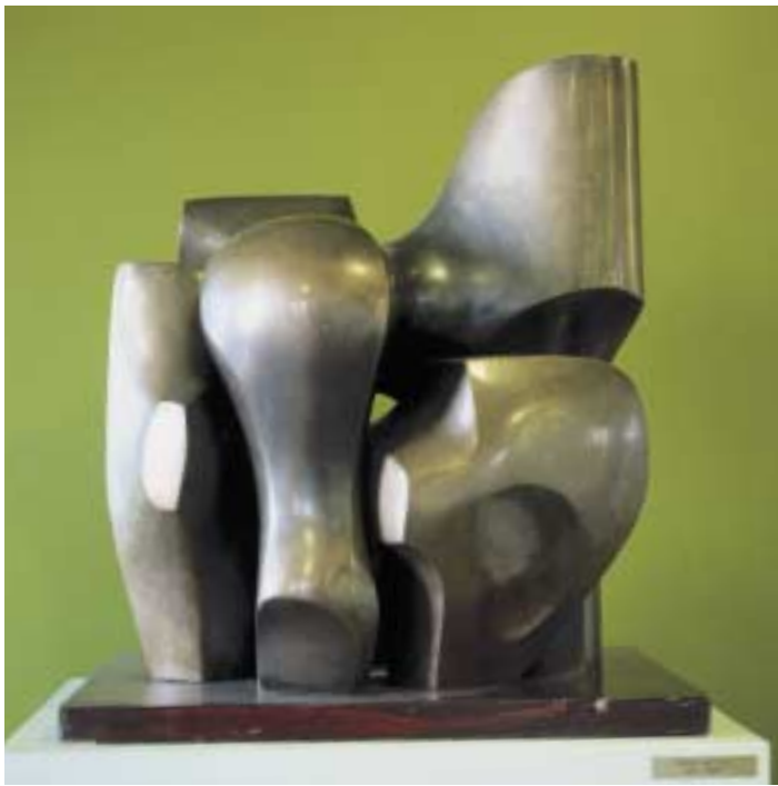
Ervin Löffler "Delt form"