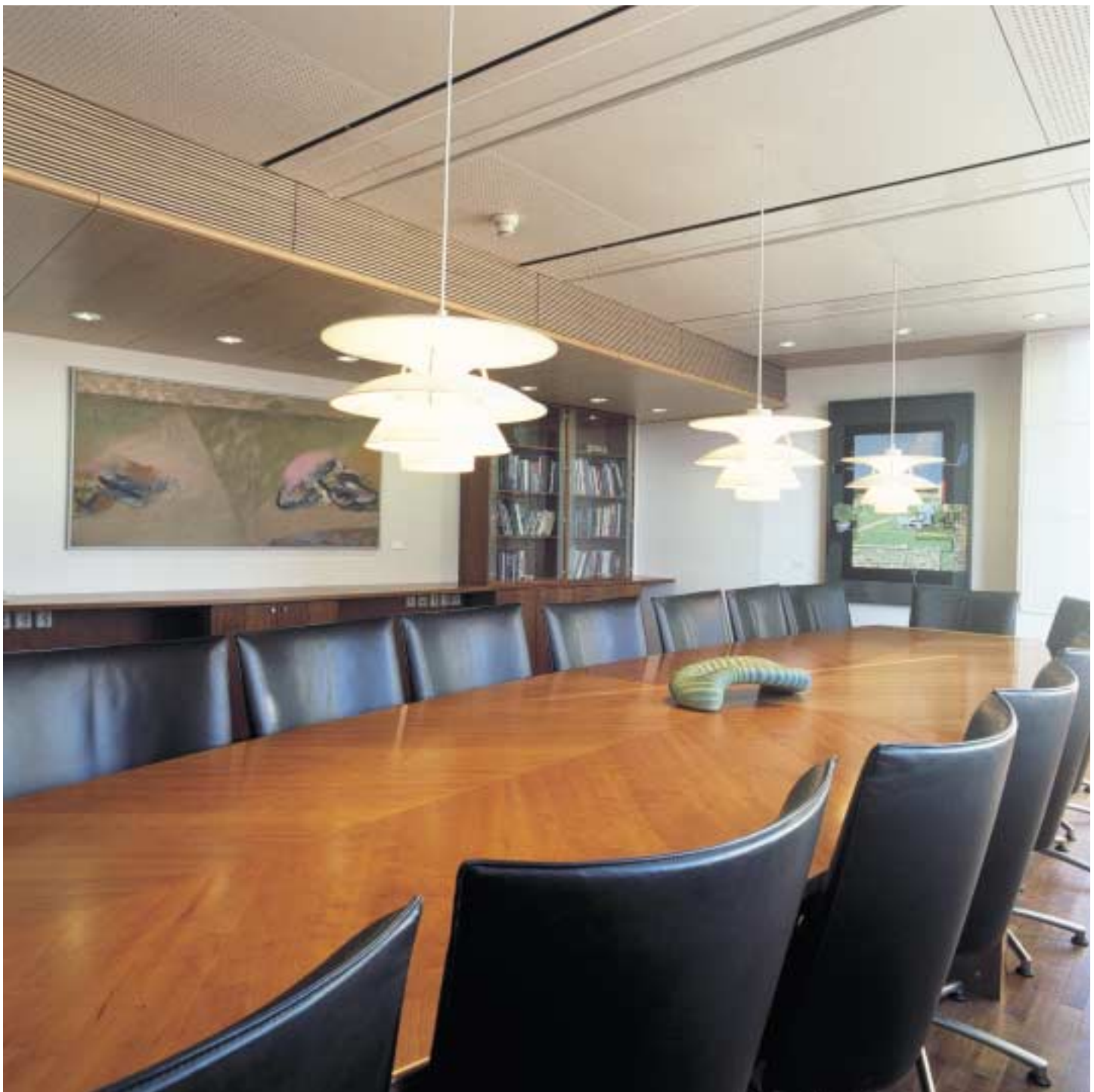
The Minister's conference room