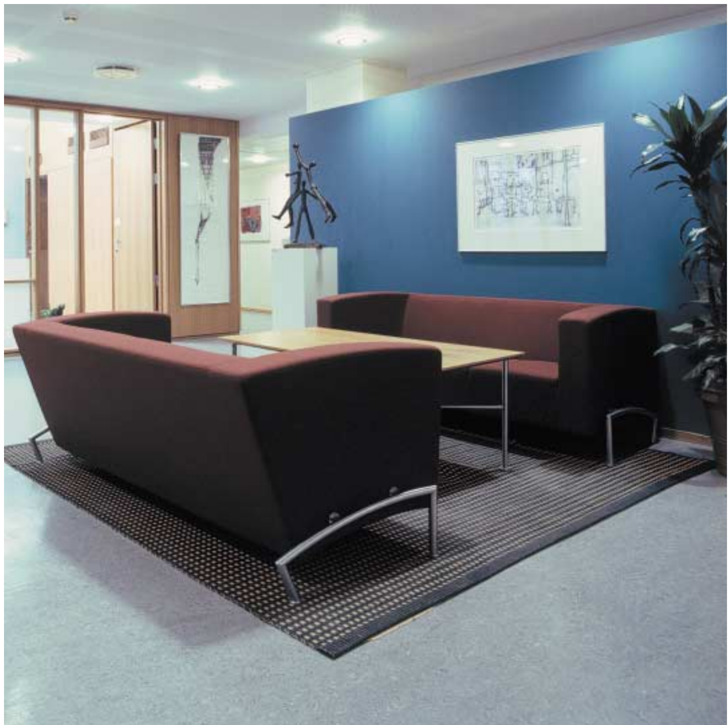
Reception at the Department of Sport Policy, Grubbegata 1, first floor