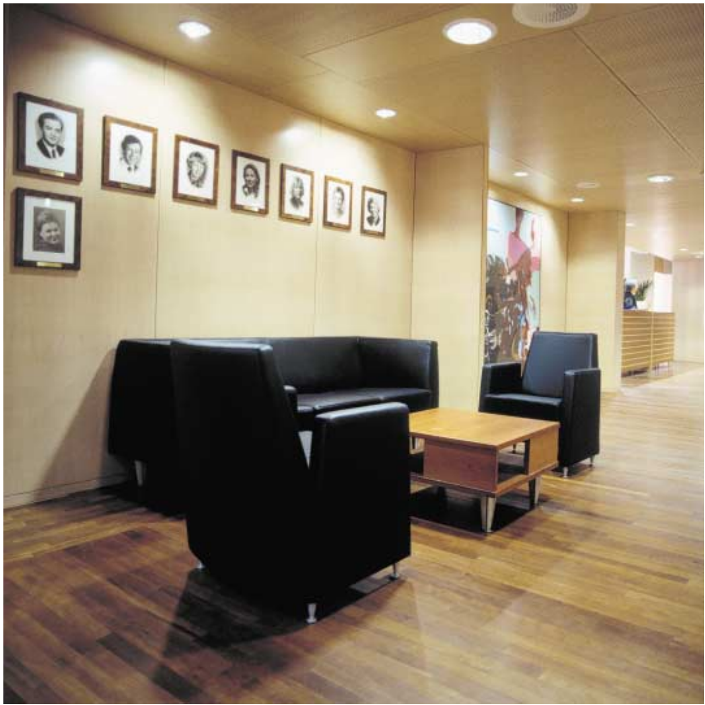
The Minister's secretariat