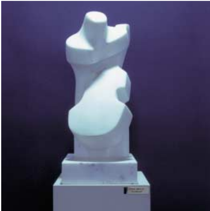
Ervin Löffler "Cellospiller"