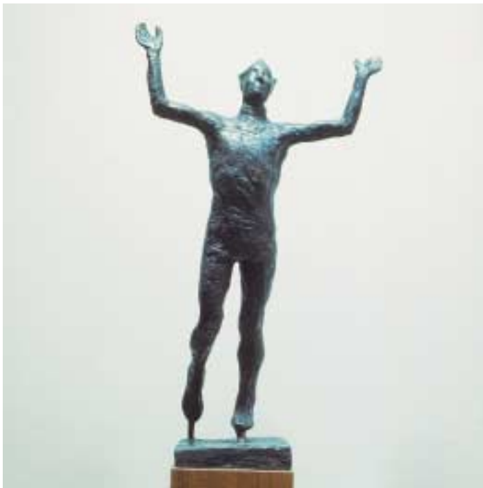
From the Department of Sport Policy