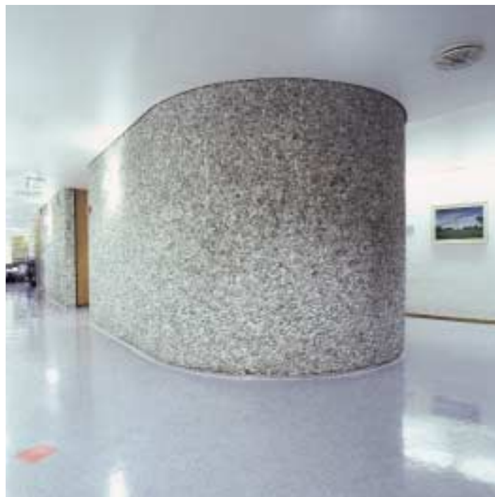
Corridor in the Department of Church Affairs