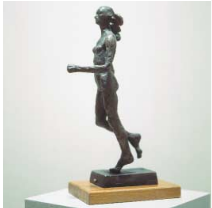
From the Department of Sport Policy