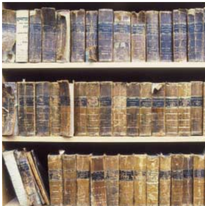
From the Department of Church Affairs