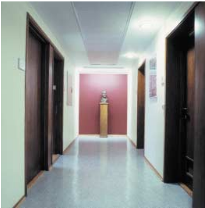
From the Department of Sport Policy