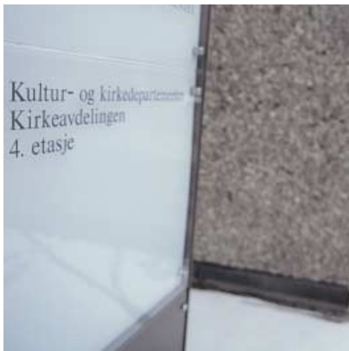
The Department of Church Affairs, Akersgaten 44