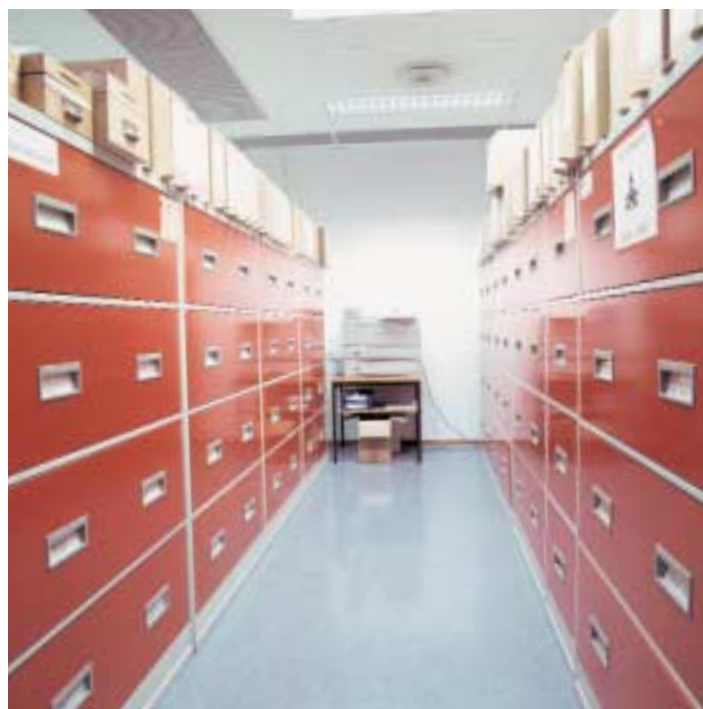
The Department of Church Affairs archives