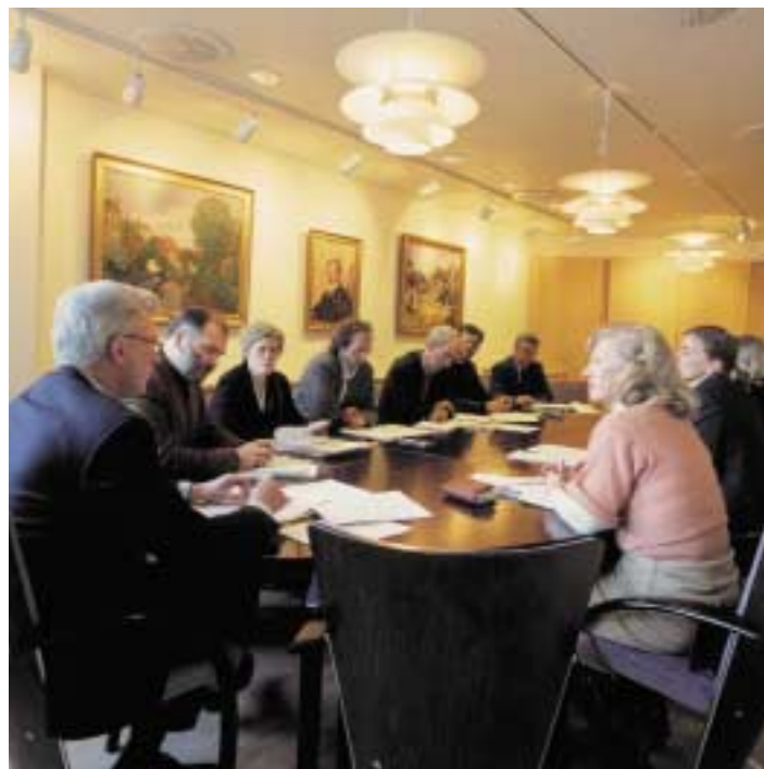
Meeting at the Department of Culture