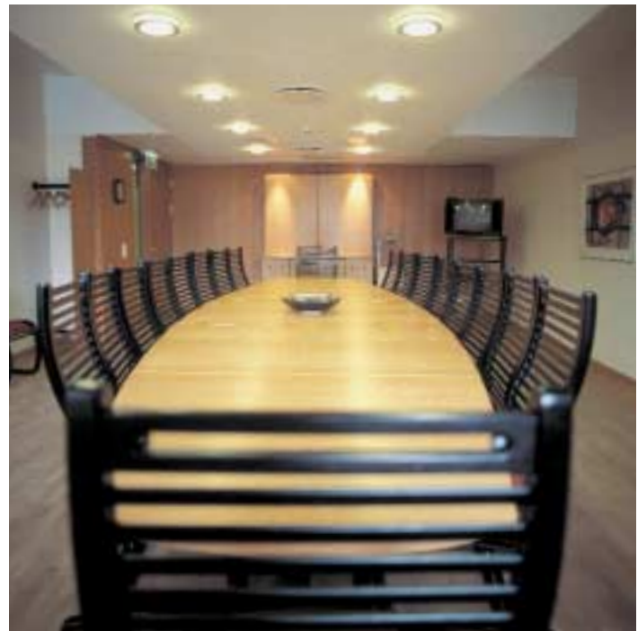
The Department of Sport Policy conference room