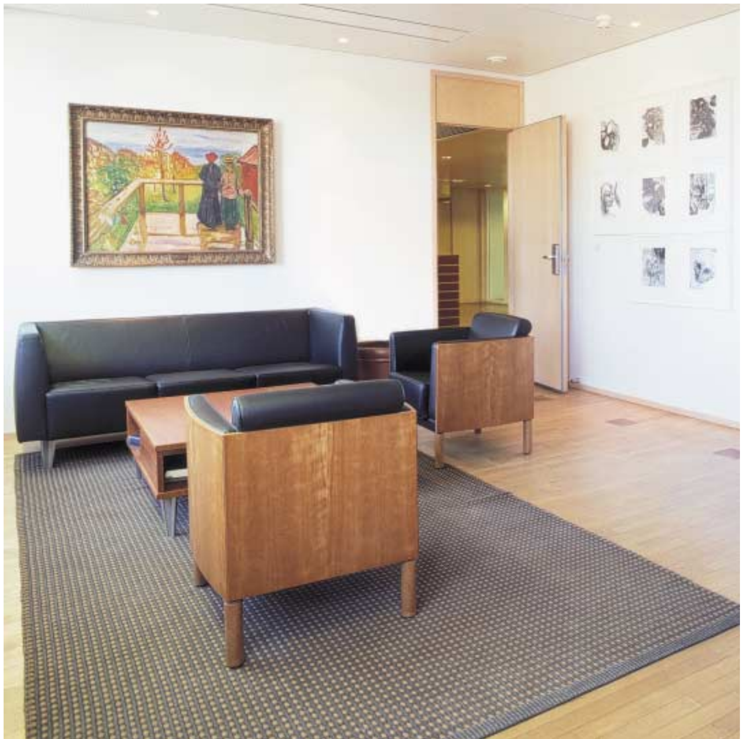
The Minister's office, Akersgaten 59, fifth floor