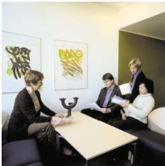
From the Department of Administrative Affairs