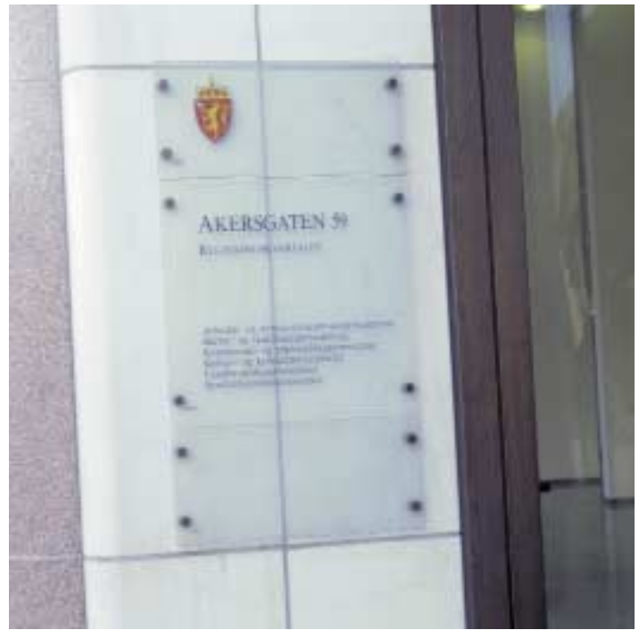
The Ministry of Culture and Church Affairs, Akersgaten 59