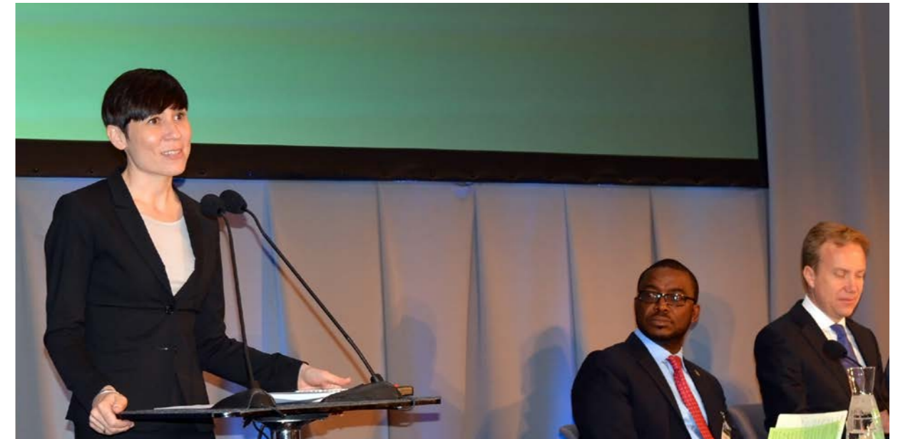
Ine Eriksen Søreide, Norwegian Minister of Defence, stressed the importance of full respect for international law in armed conflict.