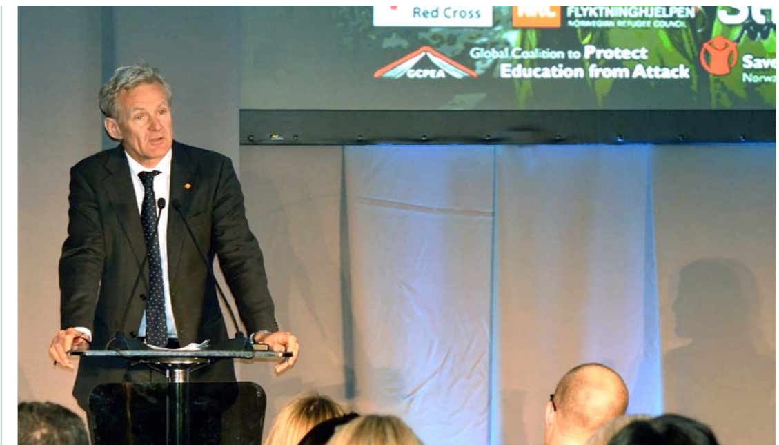
Jan Egeland, Secretary General of the Norwegian Refugee Council, encouraged states to endorse the Safe Schools Declaration, and argued that efforts in this field are long overdue.

In places in South Sudan, the entire male youth population have fled from certain villages due to the military use of schools, since they fear being forcibly recruited. Girls are kept away