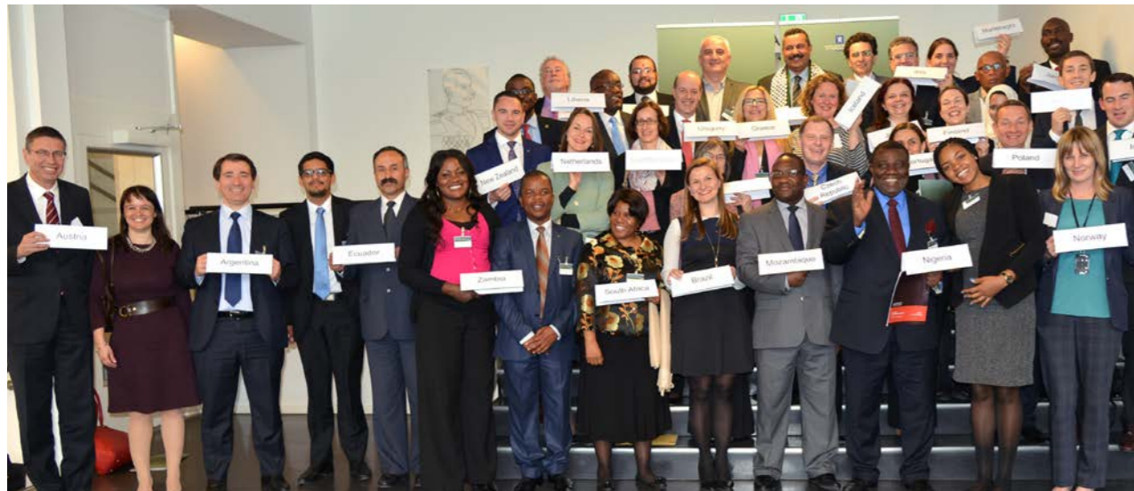
Representatives from 37 countries endorsed the Safe Schools Declaration on 29 May 2015 in Oslo.

To date, 49 states have endorsed the Safe Schools Declaration. The following 37 states endorsed the Declaration during the Conference in writing and/or in statements: Afghanistan, Argentina, Austria, Brazil, Bulgaria, Chile, the Czech Republic, Côte d'Ivoire, Ecuador, Finland, Georgia, Greece, Honduras, Iceland, Ireland, Italy, Jamaica, Jordan, Liberia, Liechtenstein, Luxembourg, Madagascar, Montenegro, Mozambique, Nigeria, New Zealand, the Netherlands, Norway, Palestine, Poland, Portugal, Qatar, South Africa, Spain, Switzerland, Uruguay, and Zambia. In addition, the Central African Republic, Chad, Costa Rica, Kazakhstan, Kenya, Lebanon, Malaysia, Niger, Panama, Sierra Leone, South-Sudan and Sweden endorsed the Declaration shortly after the Conference. The Safe Schools Declaration is still open for endorsement.