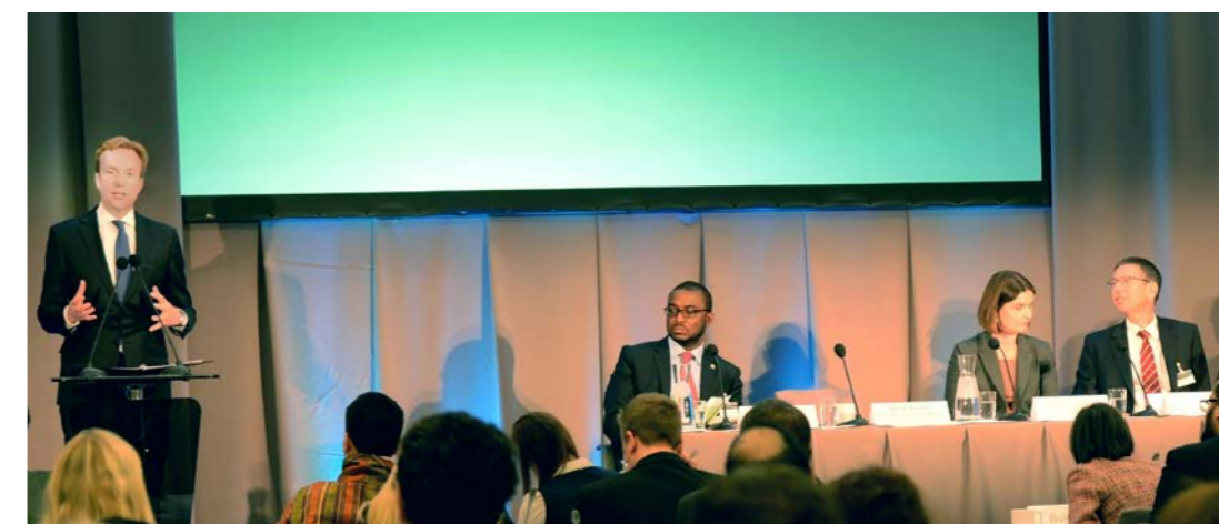
Børge Brende, Norwegian Minister of Foreign Affairs, thanked Argentina and the core group for the close cooperation in developing the Safe Schools Declaration.

It is a pleasure to welcome His Excellency Mr George Warner, Minister of Education of Liberia. Mr Warner represents a country emerging from years of civil war, and has invaluable insights regarding the importance of education during conflict. I would also like to recognise the key role played by civil society and humanitarian organisations in this process. For many of you here, the Declaration and the Guidelines