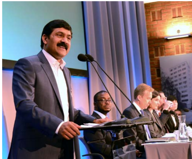
Ziauddin Yousafzai, UN Special Advisor and co-founder of the Malala Fund, called for states to show courage by clearly stating that the current situation with attacks on schools is completely unacceptable.