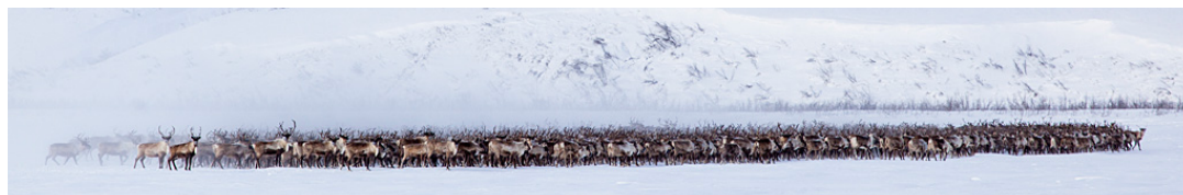
Pic: Canadian Reindeer Herd.

There has been good progress on outreach and knowledge development activities, and especially so regarding EALLU and Rievdan WP3. Interact II has been delivered as planned, and GEF/ UNEP Peatlands and Nomadic Herders Resilience has also had very good progress, external conditions taken into account.