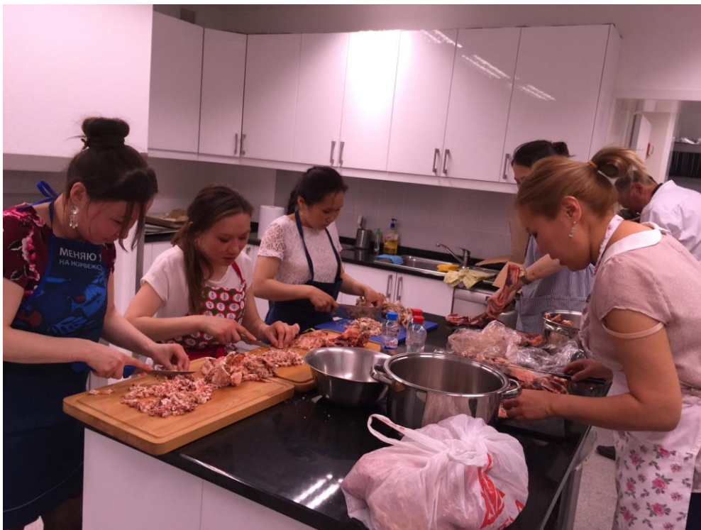
Pic: EALLU team of reindeer youth preparing traditional foods at the Norwegian Embassy Reception in Moscow. ICR, 2016.

Concerning other activities, the Centre has achieved much within the main goals of the Centre, with limited resources. Several of these activities and initiatives have shown strategic potential for the Centre, and have had significant positive impact on other operations, projects and initiatives of the Centre.