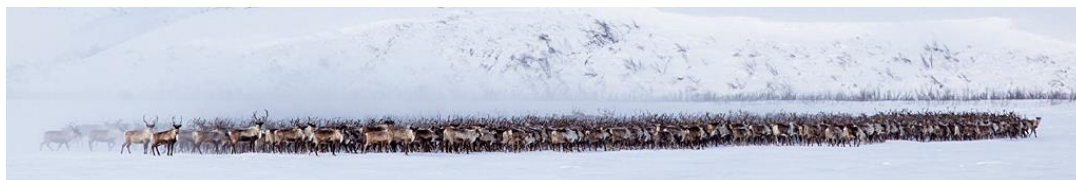
Canadian Reindeer Herd.

There has been good progress on outreach and knowledge development activities, and especially so regarding EALLU and Rievdan, as well as the ReindeerPortal including social media. GEF/ UNEP Nomadic Herders has also had good progress, the external conditions taken into account.