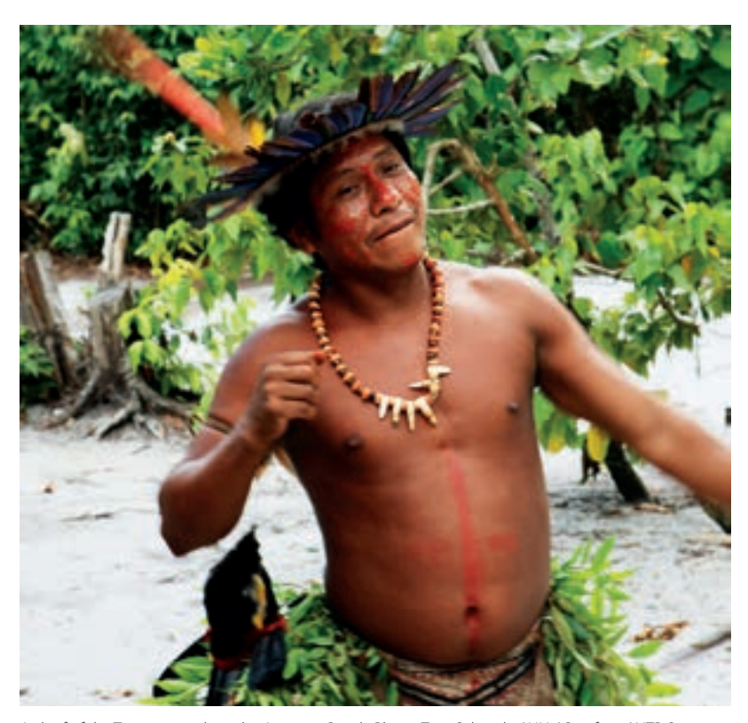
A chief of the Tucano people in the Amazon, Brazil.

As UN-REDD is part of the UN system, its standards are higher than those of the World Bank, because the UN must comply with various international agreements that are of relevance for indigenous peoples. Of particular significance in this context is the principle of participation and consultations with the aim of reaching agreement (or free, prior and informed consent often abbreviated as FPIC). In countries where various actors cooperate on forest conservation, the highest standard applies.