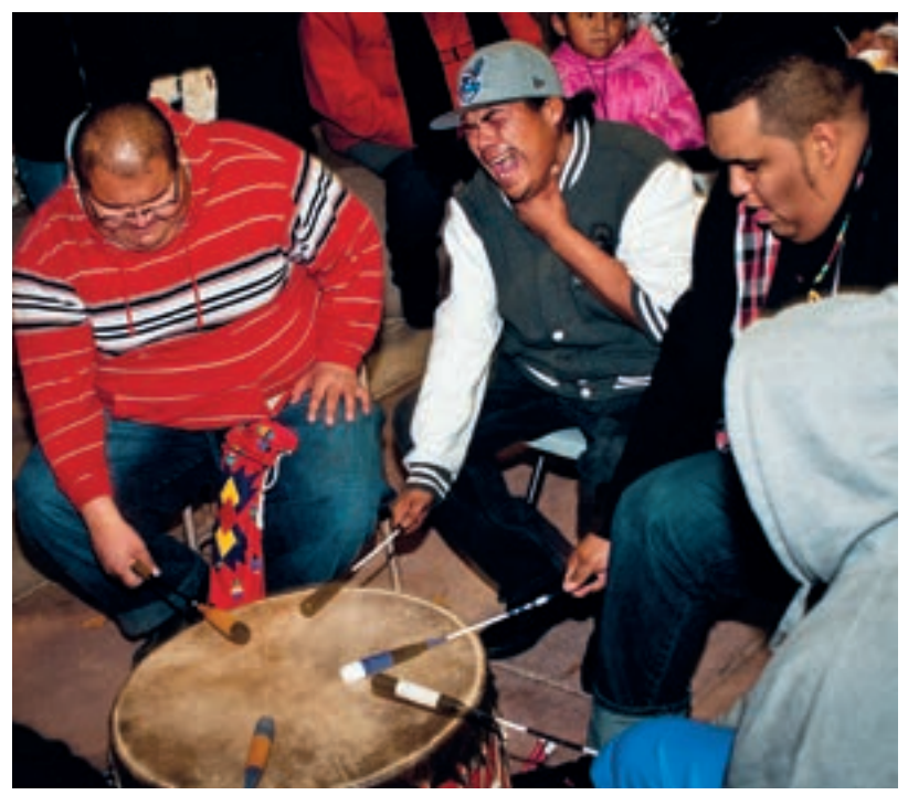
In Phoenix, Arizona, men drum to promote respect for indigenous peoples' rights as part of the "Idle No More" protest movement, which originated in Canada in 2012.

The past two decades have seen positive normative developments internationally for indigenous issues. In practice, however, indigenous peoples are still subjected to serious human rights violations. On several continents, indigenous peoples are threatened with extinction because they have lost their rights to land or resources, or as a result of the exercise of power by authorities or other groups or actors – particularly in connection with the extraction of natural resources. Indigenous peoples in many countries find that their rights are not being respected. They are subjected to structural discrimination, and in most countries they have limited opportunity to participate in decision-making processes on matters that affect them. Indigenous peoples remain the poorest of the poor, and they score lower than other population groups on most standard of living indicators, including education and health.