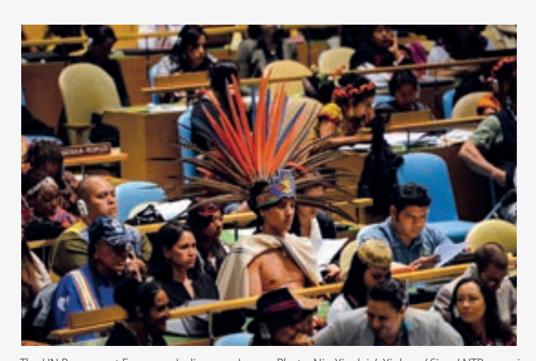
The UN Permanent Forum on Indigenous Issues.

There are currently three mechanisms in the UN system that focus on indignenous issues. There is close interaction between these three mechanisms on the coordination of international efforts in the field of indigenous issues. Norway has played an important role in supporting the establishment of all three mechanisms in the UN system, and in supporting their work to fulfil their mandates. In 2014, the UN will hold the first World Conference on Indigenous Peoples. Norway is providing financial assistance to promote the participation of representatives of indigenous peoples in international meetings in the UN and in processes that are relevant for their communities. Norway also seeks to raise indigenous issues in UN forums whenever this is natural, for example in sessions of the UN General Assembly and in the UN Human Rights Council, including in the Universal Periodic Review process.