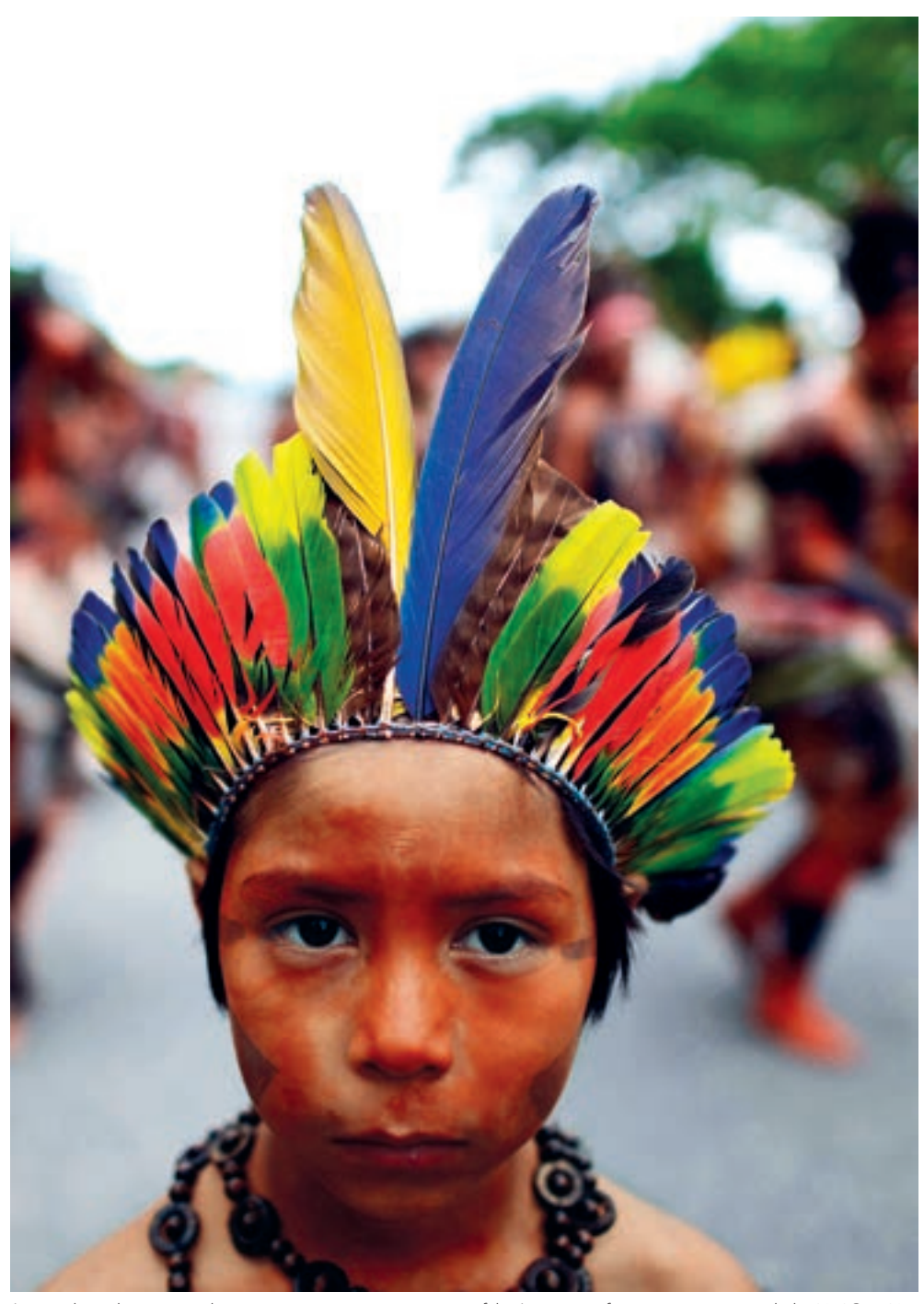
A young boy takes part in a demonstration to promote protection of the Amazon rainforest, in connection with the 2012 Rio+20 Conference in Rio de Janeiro, Brazil.