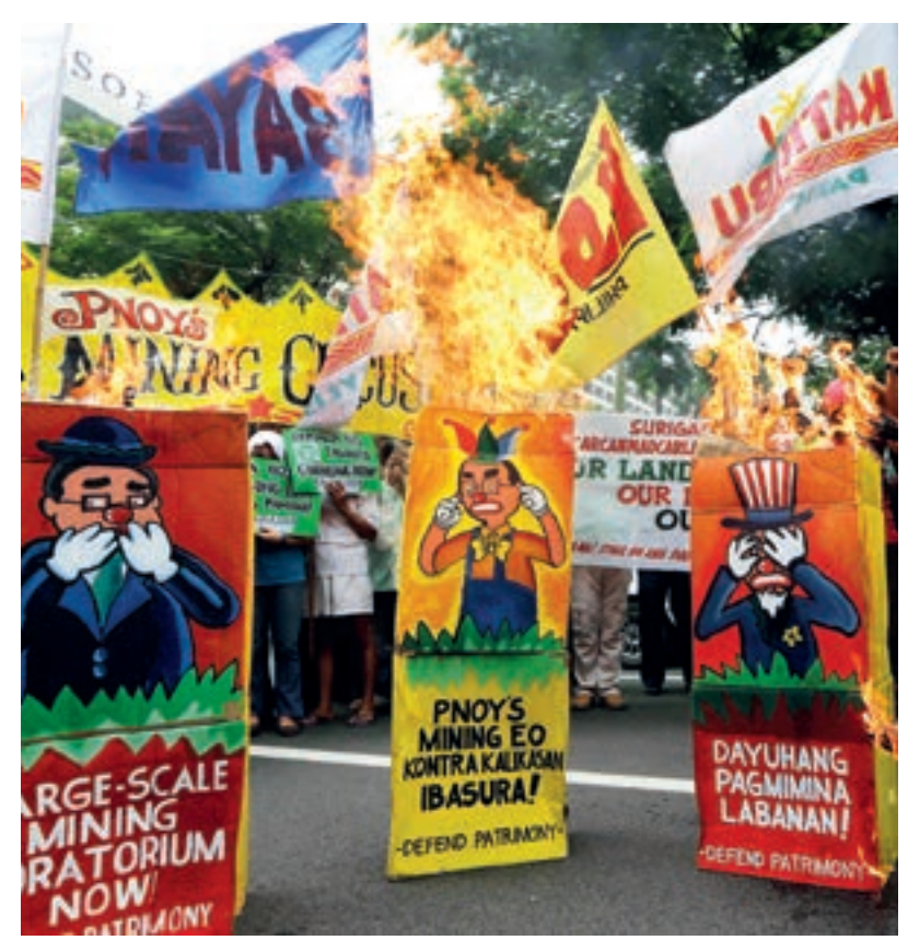
Demonstration in Manila, the Philippines, against a mining project that people fear will force indigenous communities to move.

The Guiding Principles also provide recommendations on how states and business enterprises are to proceed when planning activities that may have an impact on indigenous peoples' land areas and their use of natural resources. A process of "due diligence" is to be carried out, which should include assessments of any adverse human rights impacts on indigenous peoples that the business enterprise may cause or contribute to through its own activities, or which may be directly linked to its operations, products or services by its business relationships.