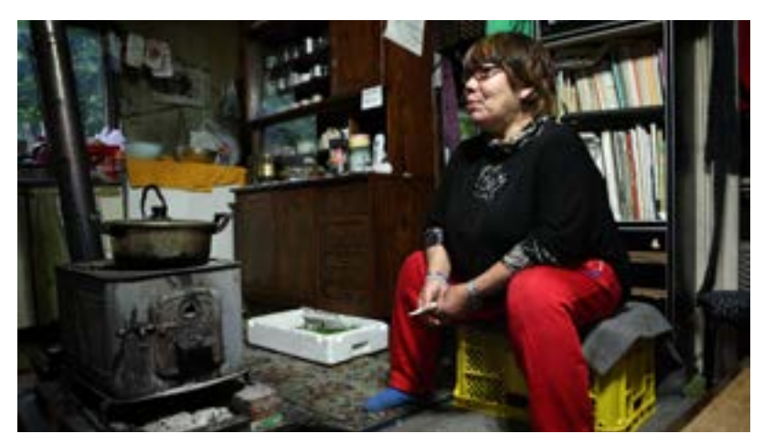
An Ainu woman in her home. The Japanese authorities have recently recognised the Ainu people as an indigenous people in the country.

It is important to include indigenous women in the consultations. In societies where there are conflicts between indigenous peoples and the majority population, indigenous women may find gender issues to be divisive within the indigenous community and may therefore under-report gender-based discrimination in their community. In many indigenous communities, women do not traditionally participate in governing bodies and women's views do not tend to be heard. Many indigenous women therefore face "double discrimination", both as women in the indigenous community and as indigenous people in the society at large.