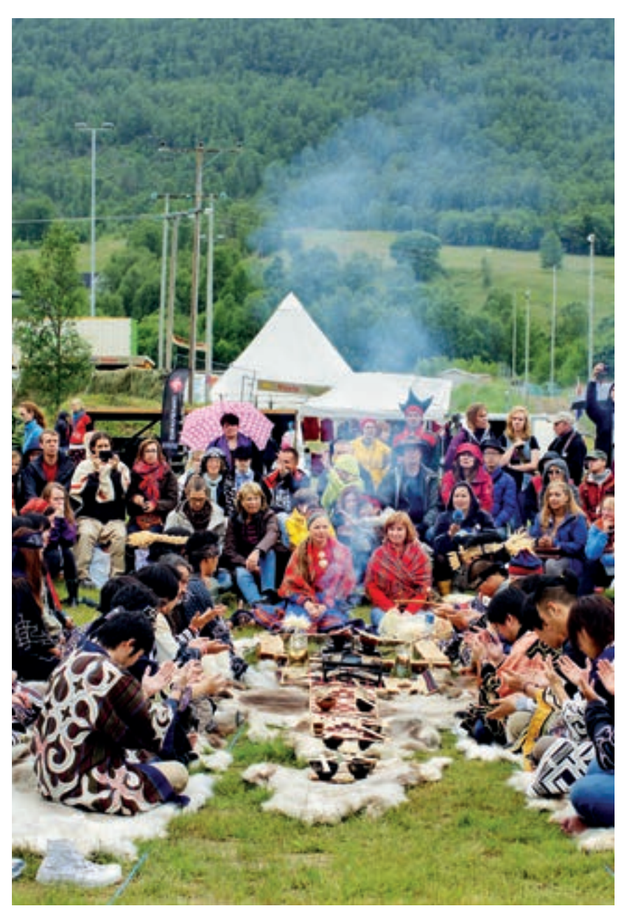
The Riddu Riddu indigenous peoples' international cultural festival is held every year in Manndalen in Nord-Troms county, North Norway.