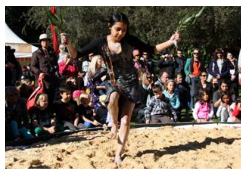
An Aboriginal girl performs a traditional dance at a festival in Sydney, Australia.

These guidelines seek to ensure that Norway pursues a coherent, integrated policy that takes into consideration the rights of indigenous peoples.