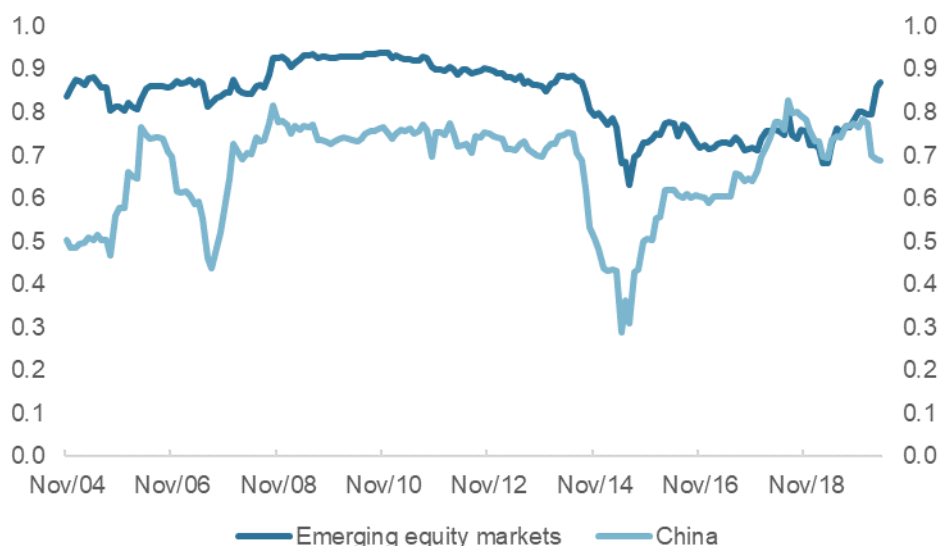
Chart 2: Three-year rolling correlation with a global equity index from MSCI