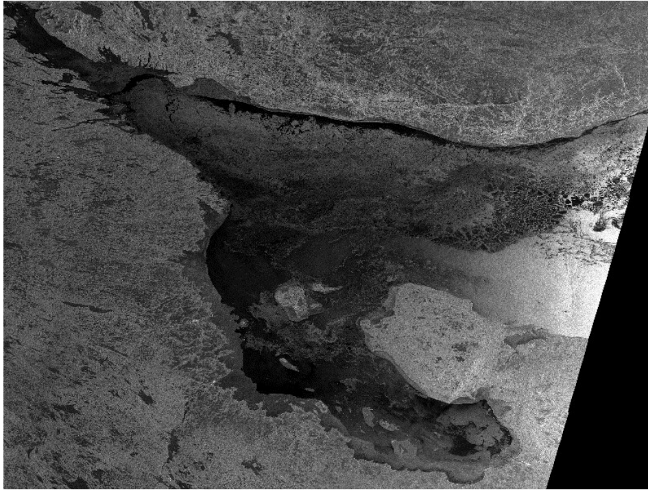
Figure 2 – Satellite image of ice conditions on 12 March 2016