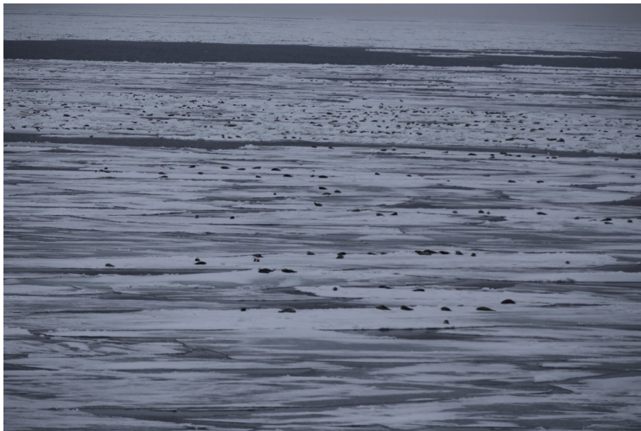
Figure 3 – Distribution of Barents Sea/White Sea harp seals (of all ages) during moult in the south eastern part of the Barents Sea (mean position 69.75°N/57.50°E) on 16 April 2016 (photo from oil platform “Prirazlomnoe”)