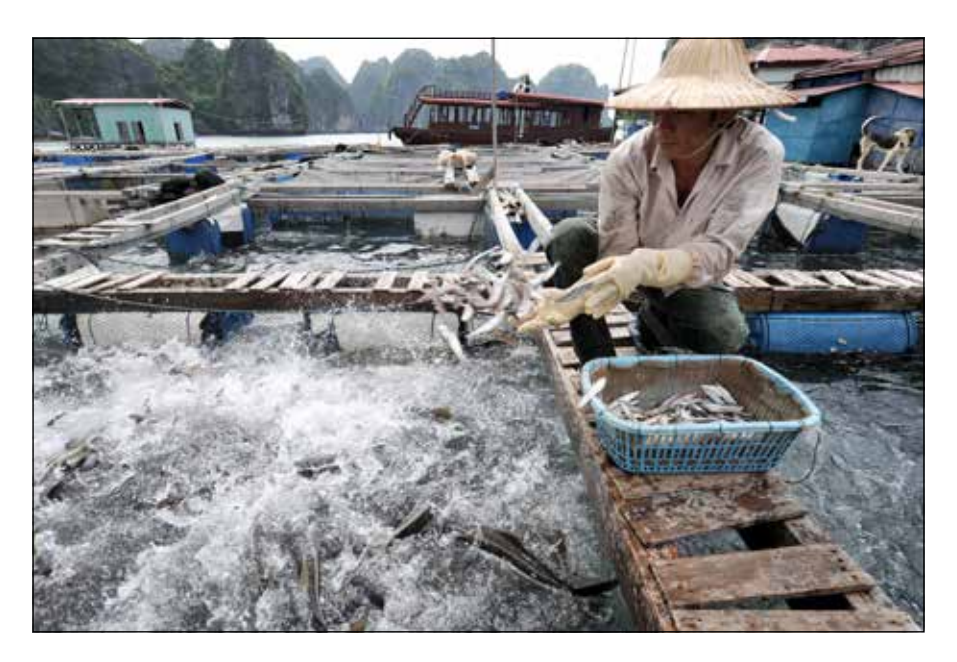
Figure 2.4 Norway has supported the development of the fisheries sector in Vietnam since 1998.