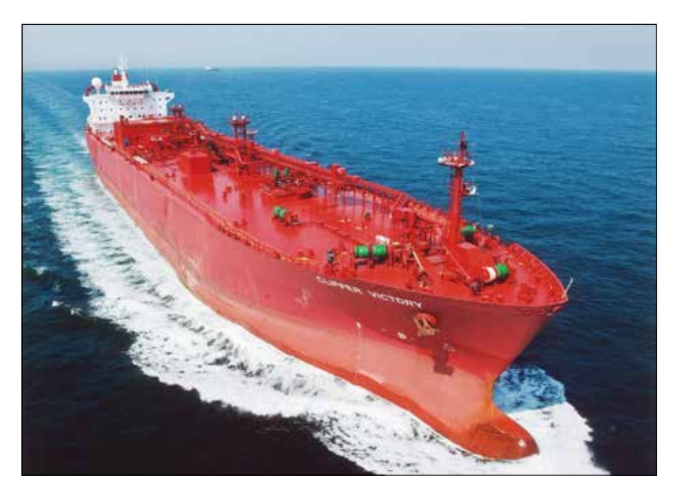
Figure 2.1 International shipping plays a key role in facilitating world trade.

it vital to promote sustainable use of marine resources and the view that sound use and conservation need not be mutually exclusive.