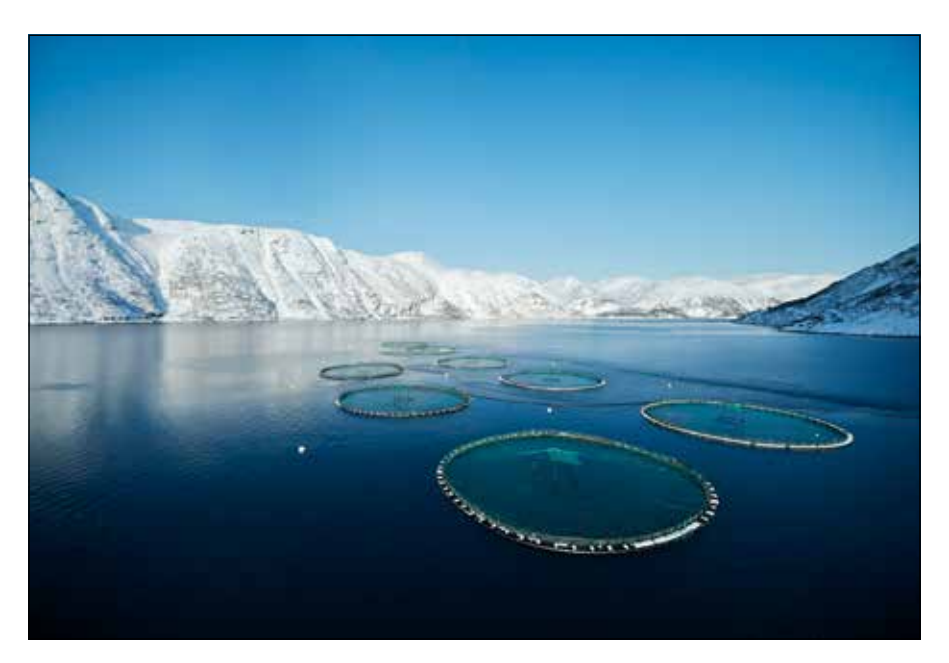
Figure 2.2 Norway is the world's largest producer of sea-farmed fish. The photo shows net cages used for the production of salmon.