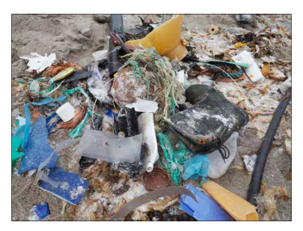
Figure 2.3 Marine litter and microplastics in the oceans are a growing international concern.