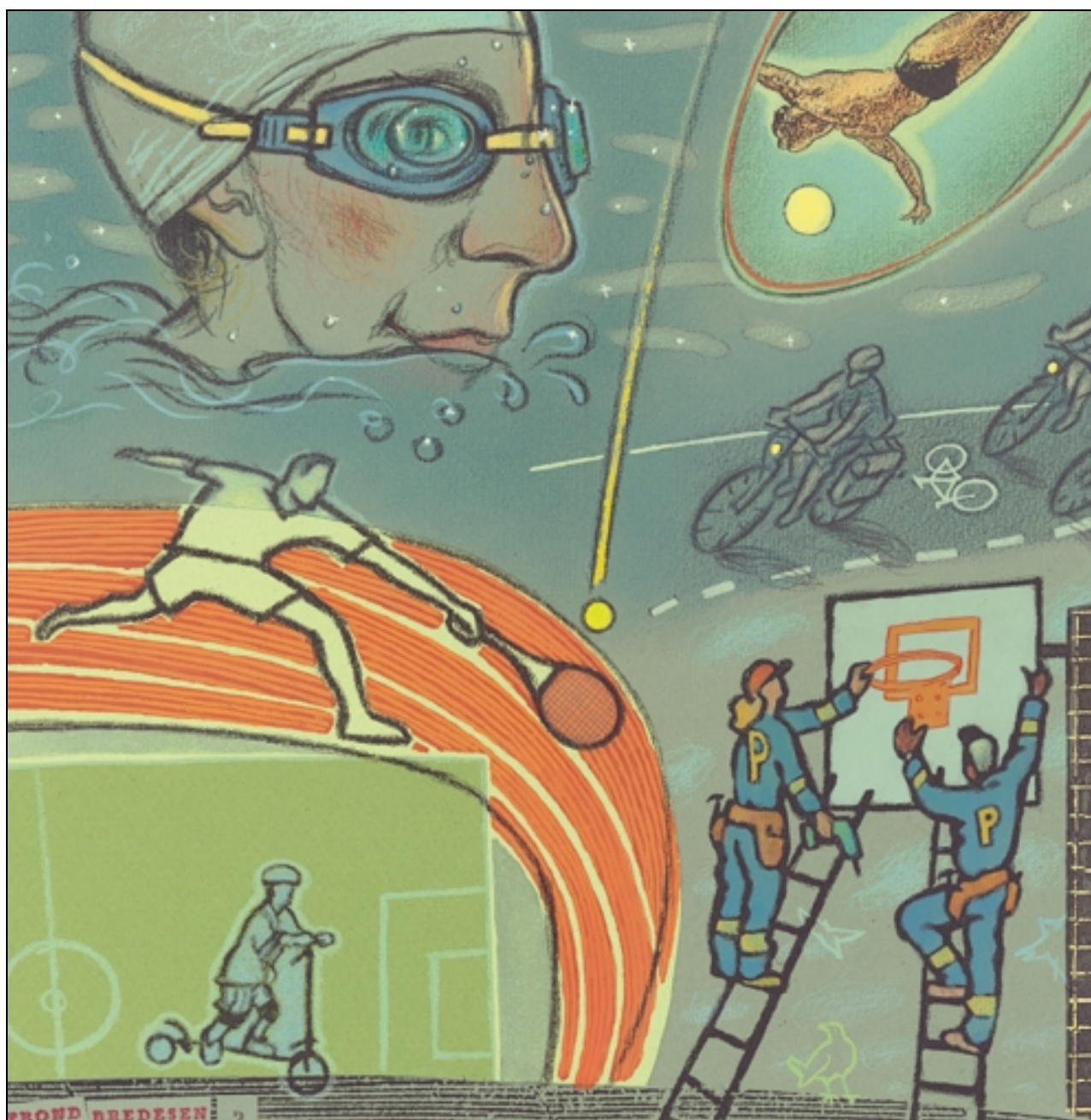
Figure 4.1: Healthy lifestyle choices

«Success will depend on cooperation between the individual and the authorities – where both parties take responsibility and make an active contribution»