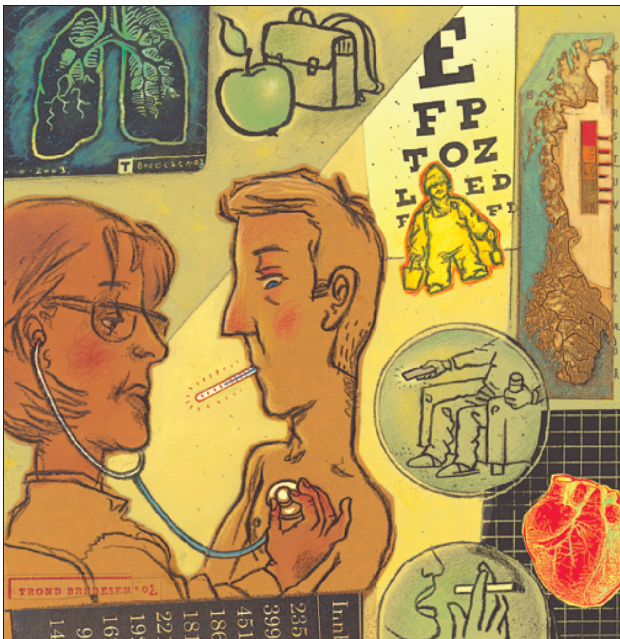
Figure 2.1: The diagnosis

«Surveys indicate that the level of physical activity is too low in more than half of the adult population»