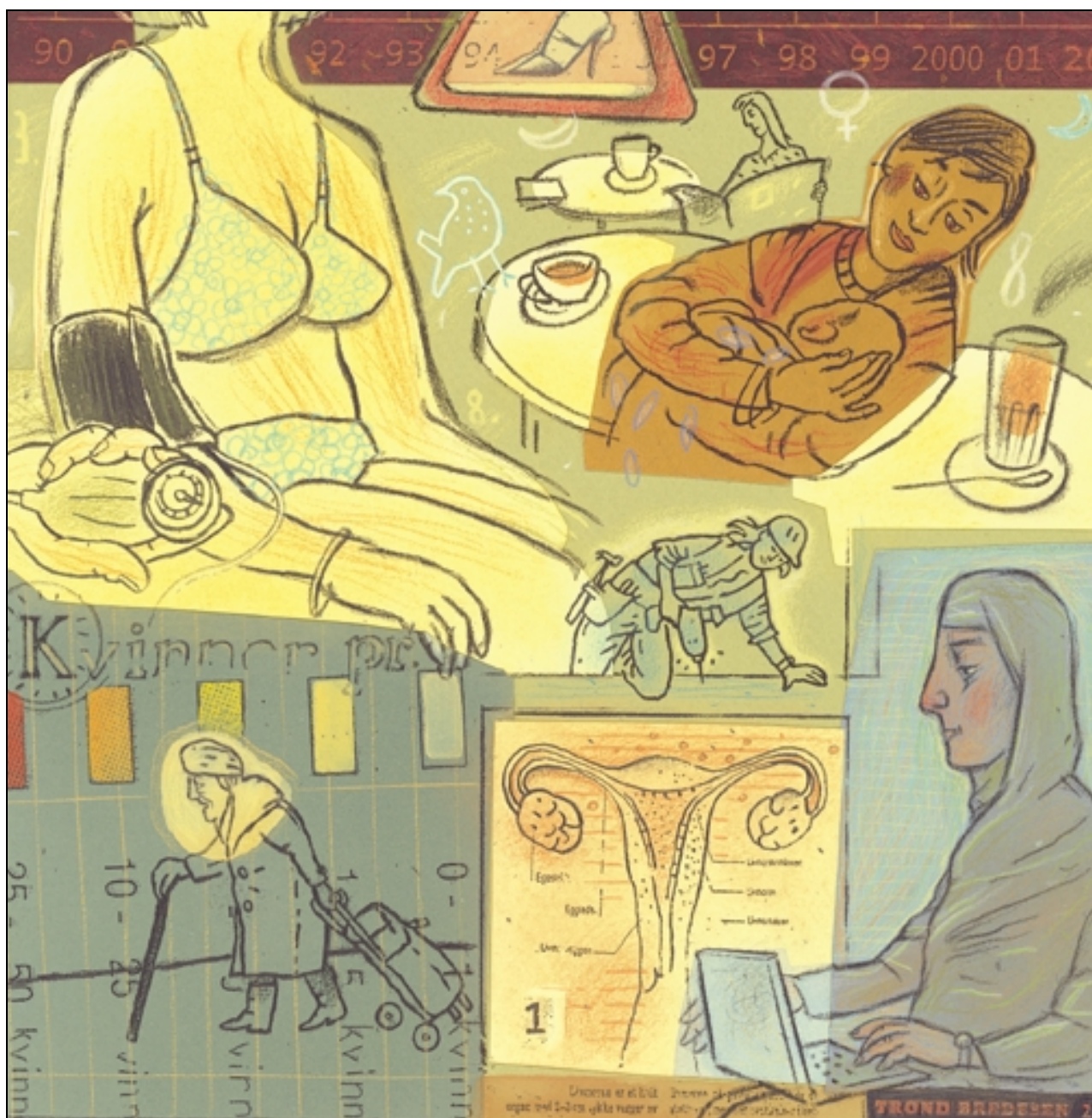
Figure 8.1: A strategy for women's health

«Since women and men are different, the various measures will have different effects. In some cases it will be necessary to implement different measures for women and men.»