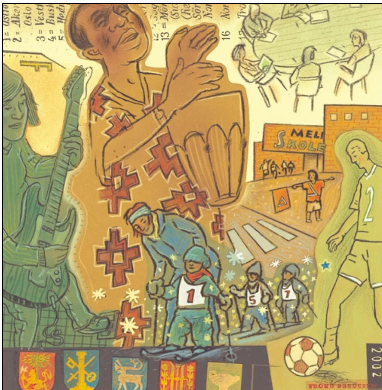
Figure 5.1: Building alliances to promote public health

«A broad approach to public health work means mobilizing (and coordinating) a large number of players in society.»