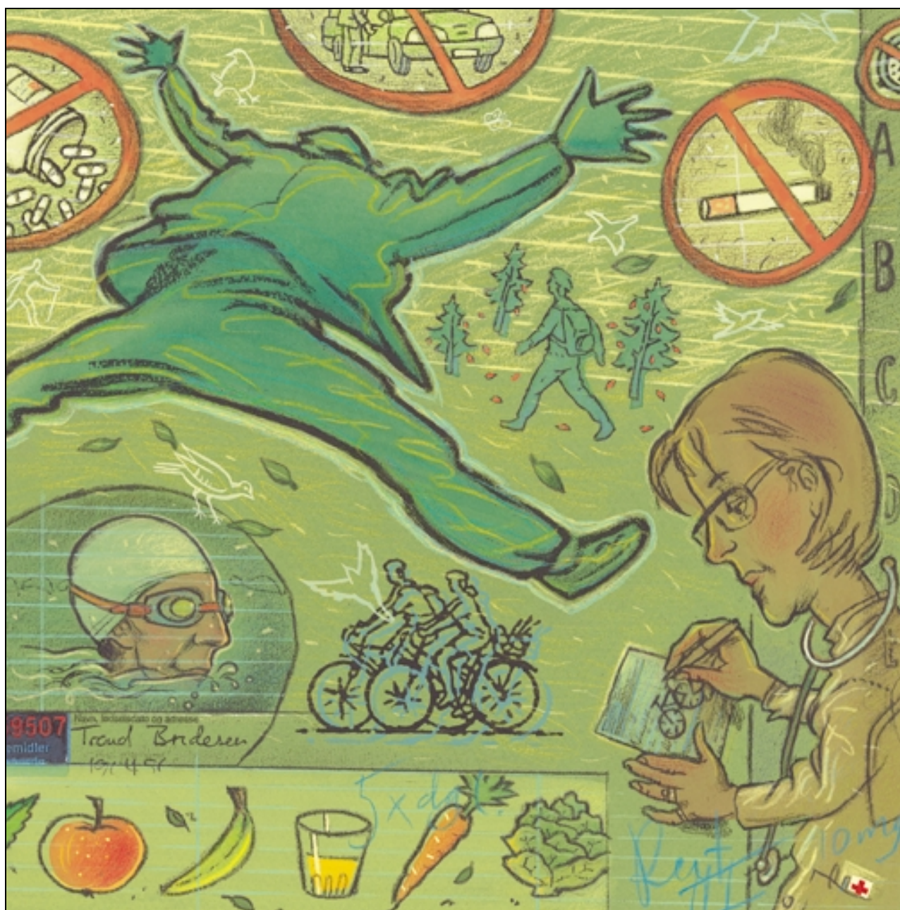
Figure 6.1: The health services: Prevention is better than cure

«The health service has not fully exploited the potential gains in preventive measures. There are many areas where it is possible to prevent more and cure less.»